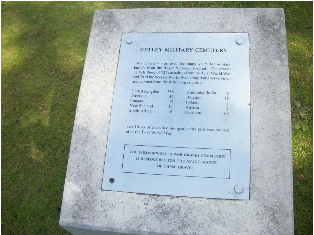
Netley Military Cemetery, Hampshire