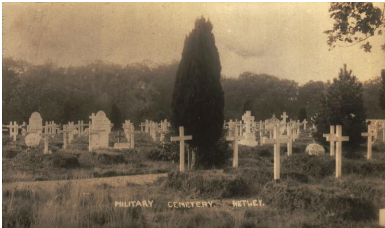
Original Cross markers – Netley Military Cemetery